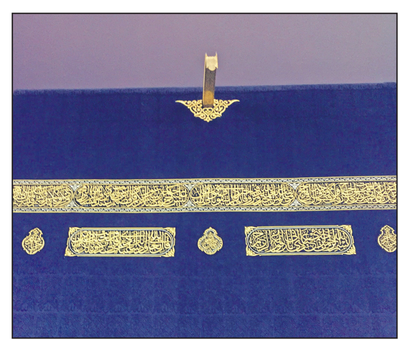
The recent gutter was handcrafted from pure gold at the behest of the late King Fahd. Muslims believe that prayers under the gutter are granted by Allah.