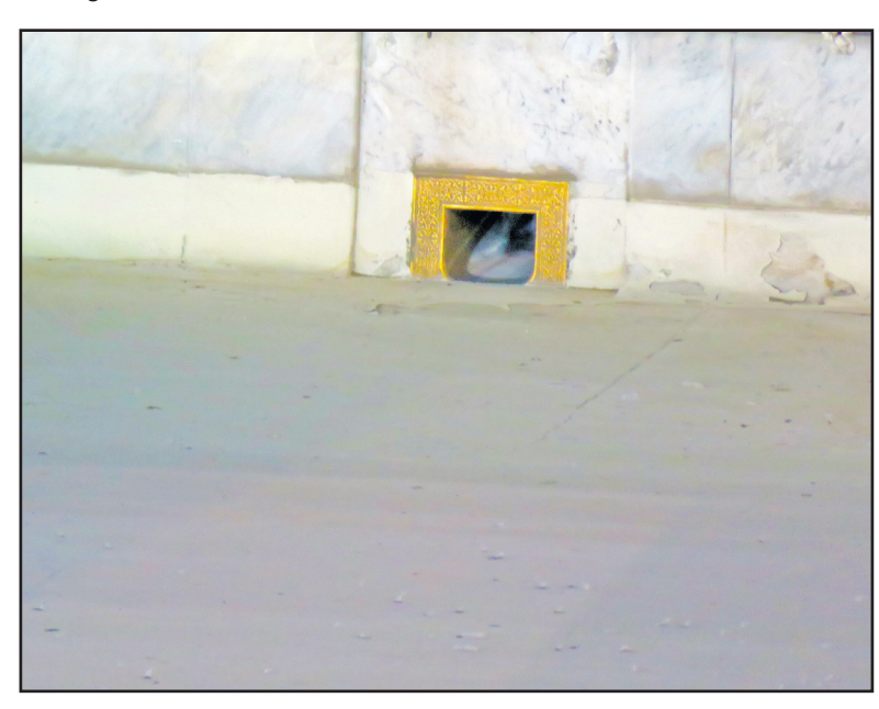
A close-up view of the water outlet leading to the meezab of the Kaabah.