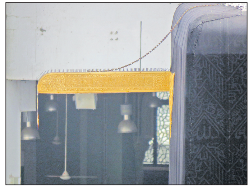
The sharp spikes on the spout of the meezab prevent birds from perching or nesting there.

The construction which was done under the auspices of Murad Khan was exactly the one done at the time of Abdul Malik ibn Marwan, which is the way the Quraish