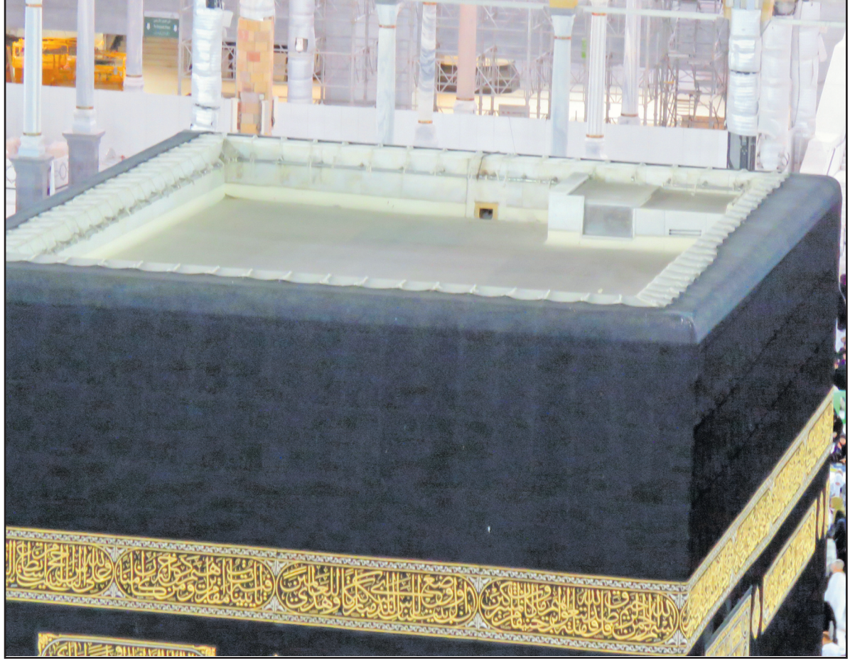
The box-shaped roof of the Kaabah leads to water accumulation, hence the need for the meezab to allow the water to flow away.

This gutter is also known as the 'rainspout of blessing' and Muslims believe that prayers under the gutter are granted by Allah.